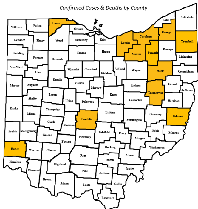
Confirmed Cases & Deaths by County

COVID-19 numbers provided by ODH daily at 2:00 PM